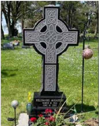
Single Celtic Cross - India Black