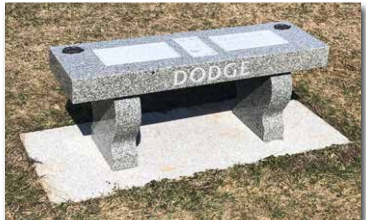
Companion Bell Leg Bench - India Gray With VA Bronze Medallions