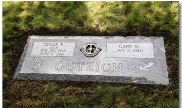
Companion Polished Bevel - Bahama Blue With Bronze Vase