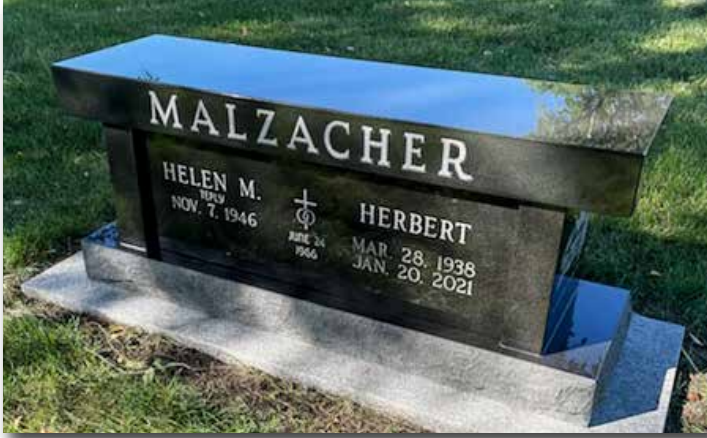
Companion Cremation Bench - India Black

Granite bench memorials are a newer headstone option that are gaining popularity as a place to sit and reflect. Benches can have a single pedestal or are supported by two legs underneath.