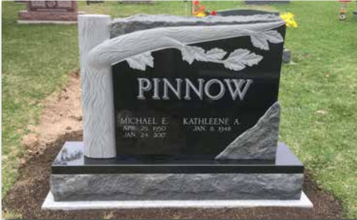
Companion Sculpted Tree - India Black

Upright granite memorials are available in a variety of custom shapes with sculptural elements.