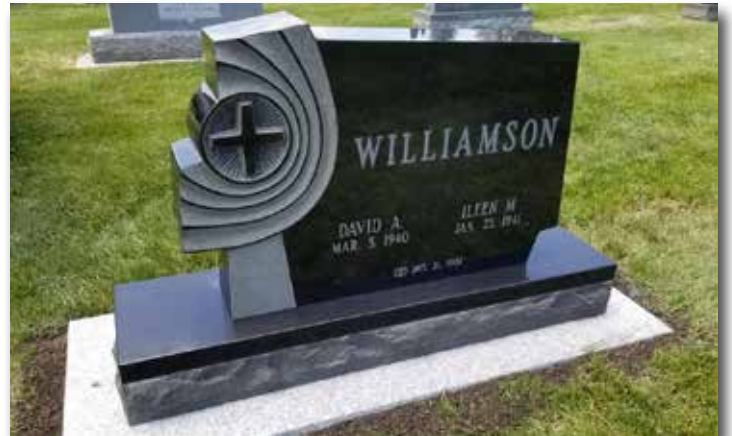
Companion P5 Upright - India Black With Starburst