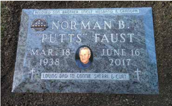
Single Polished Bevel - Bahama Blue With VA Bronze Medallion and Ceramic Photo