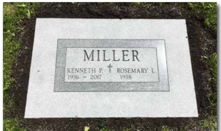
Companion Flush Marker With Granite Wash - Southern Gray