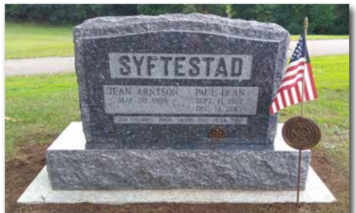
Companion P2 Upright - Blue Pearl With VA Bronze Medallion and Flag Holder