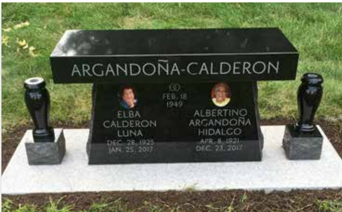
Companion Pedestal Bench - India Black With Ceramic Photos and Granite Vases