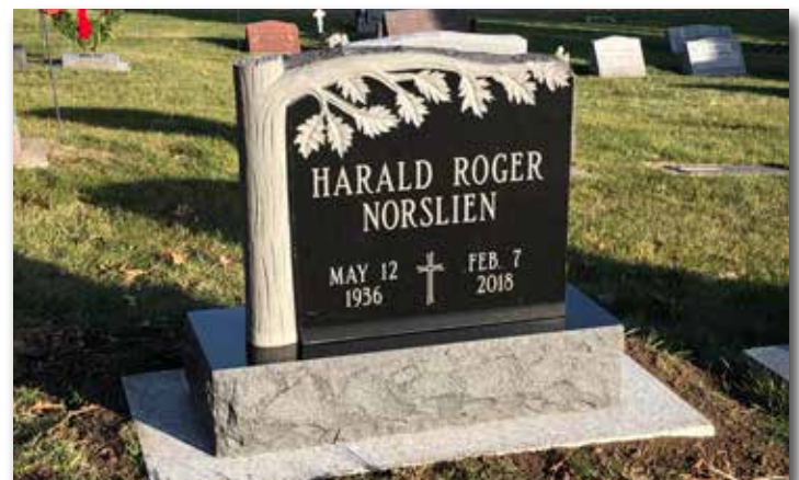
Single Sculpted Tree - India Black