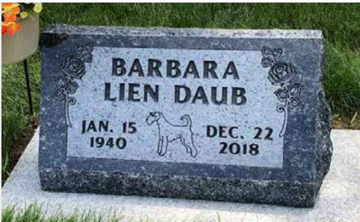
Single Slant - Blue Pearl With Shape-Carving