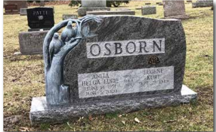
Companion Sculpted Birds - Bahama Blue With VA Bronze Medallion