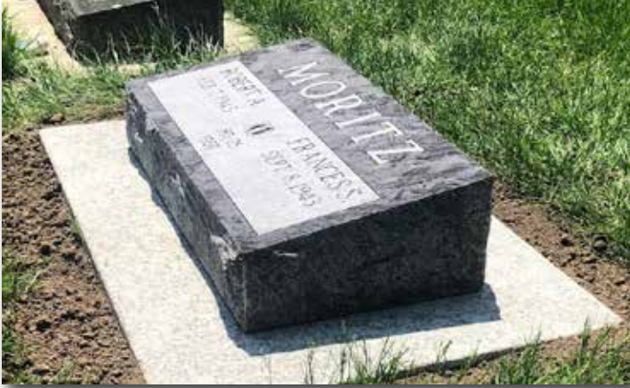
Companion Bevel Marker - Bahama Blue

A granite bevel memorial is set above ground on a foundation, and has a gentle slope from back to front. A flush memorial typically lies flat in the ground, but can also be set above ground on a foundation.