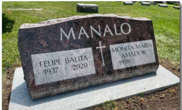
Companion Slant - Meteor Shower