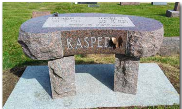
Companion Kidney Bean Rustic Bench - Dakota Mahogany With Bronze Artwork