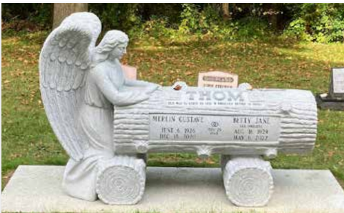
Companion Custom Sculpture - Imperial Gray