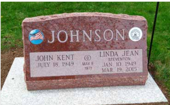
Companion Slant - Sentinel Red With Ceramic Photos