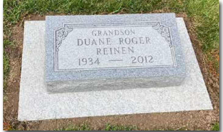
Single Bevel Marker - Southern Gray With Shape-Carving