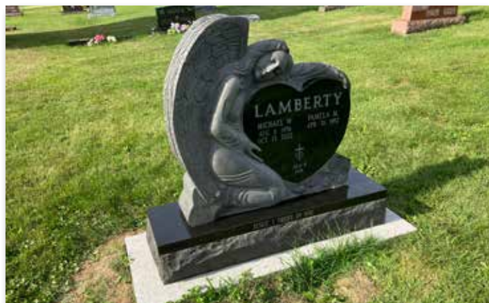
Companion Sculpted Angel - India Black With Ceramic