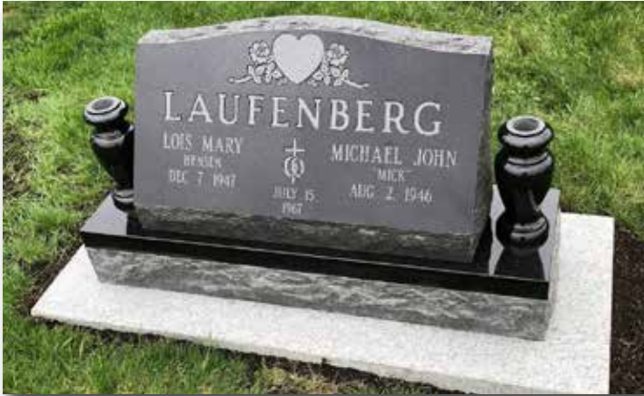
Companion Slant on Base - India Black With Granite Vases

Slant memorials differ from flush and bevel memorials in that they are larger, which affords more room for engraving. Slants also have a back which can be used for additional engraving and artwork.