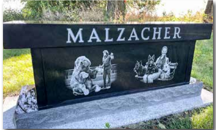
Companion Cremation Bench - India Black With Etchings