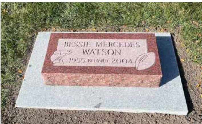
Single Flush Marker Above Ground on Foundation - Sentinel Red