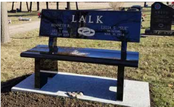
Companion Park Style Bench - India Black