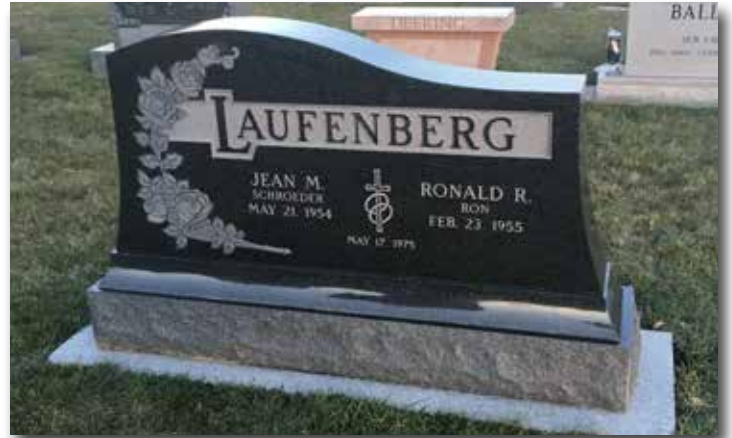
Companion P5 Upright - Impala Black With Shape-Carving and Hand-Tooling