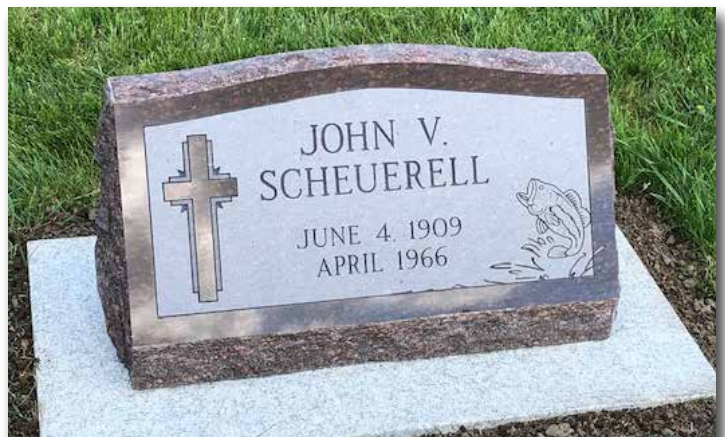
Single Slant - Cats Eye Red