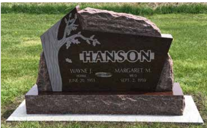
Companion PM21 Upright - Cats Eye Red With Etched Rings