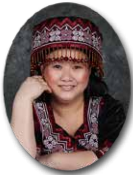
Color Ceramic Portrait