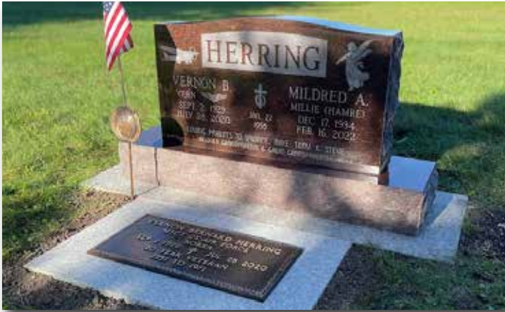
Companion P3 Upright - Cats Eye Red With VA Bronze Plate on Foundation

A granite upright memorial is built of two pieces, respectively called a tablet and a base. Being the largest relative to flush, bevel, or slant memorials, they offer the most space for engraving and personalization.