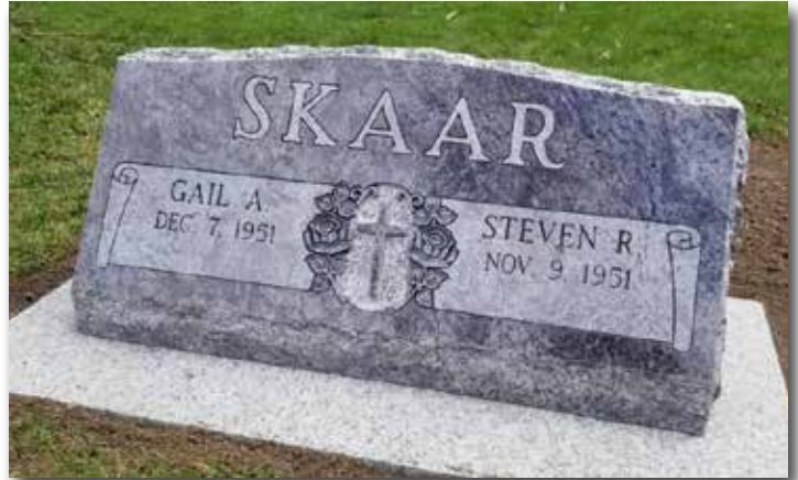
Companion Slant - Bahama Blue With Shape-Carving and Hand-Tooling