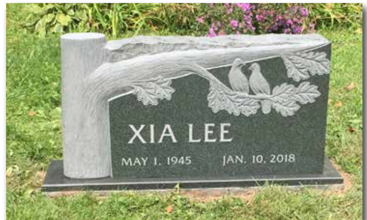
Single Sculpted Tree - Evergreen